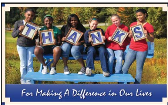
Visit us online at www.unitedwaytriangle.org to learn about the difference your gift makes.

In 2007, under the auspices of women leadership volunteers Judy O'Neal and Judy Orser, the women's leadership campaign had a total of 105 women leadership donors and raised more than $168,000 for WakeMed's overall campaign.