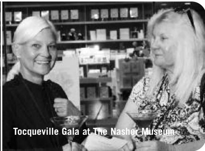
Tocqueville Gala at The Nasher Museum