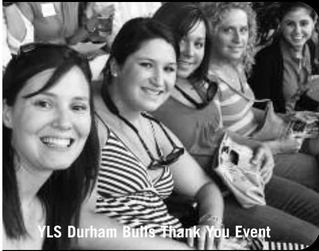
YLS Durham Bulls Thank You Event