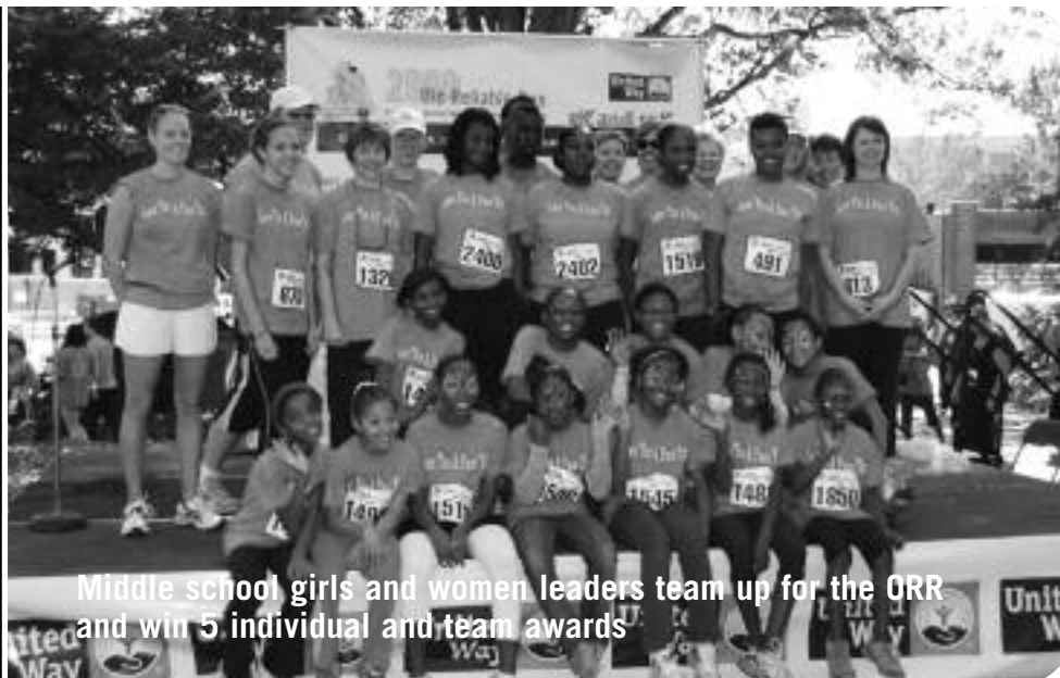
Middle school girls and women leaders team up for the ORR and win 5 individual and team awards