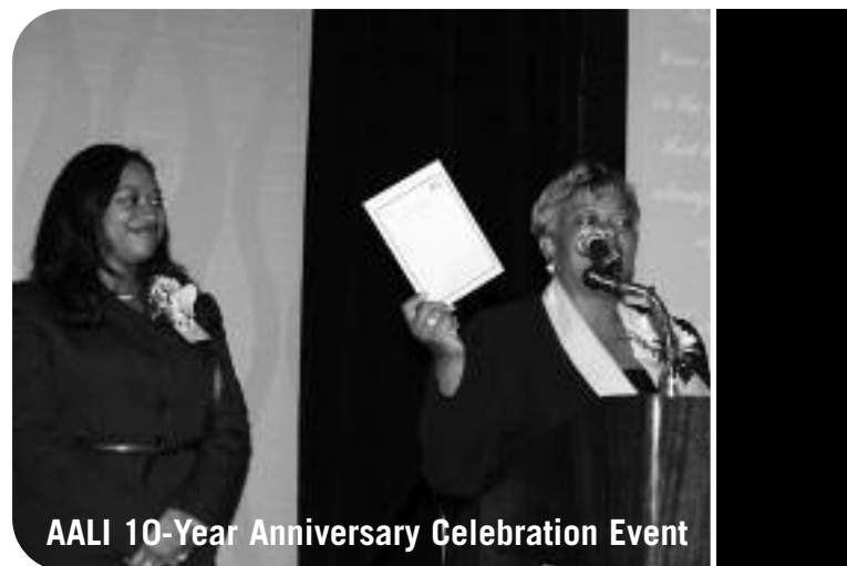
AALI 10-Year Anniversary Celebration Event